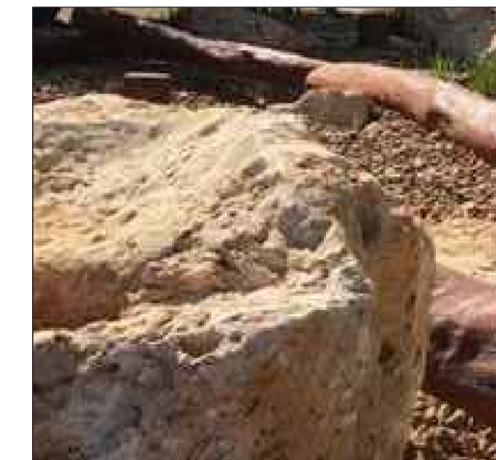
BASALT BOULDERS AS SEATING OPTION