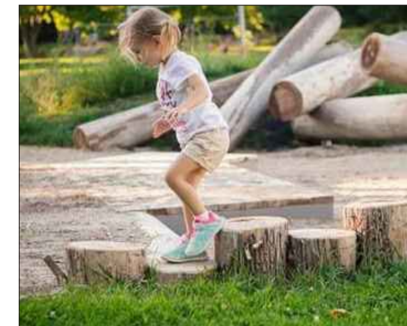
TIMBER LOGS FOR BALANCING