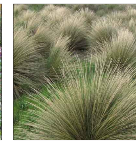
POA POIFORMIS VAR. RAMIFER