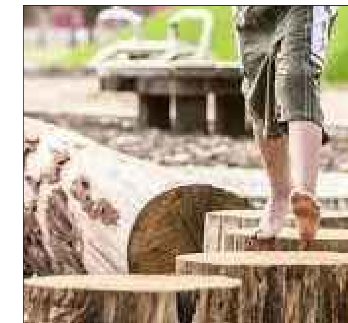
TIMBER LOG AS STEPPER