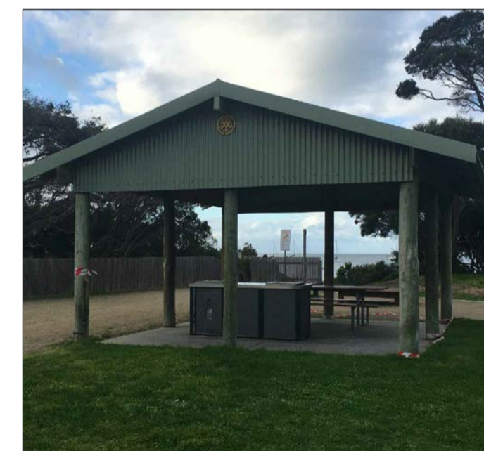
BARBEQUE SHELTER OPTIONS